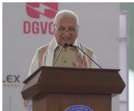
Hon'ble Governor of Bihar Shri Arif Mohammad Khan addressing the entrepreneurs