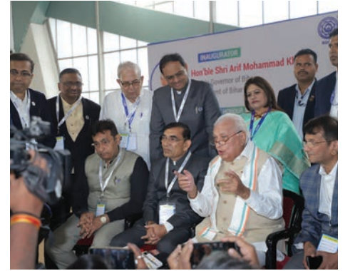
Hon'ble Governor of Bihar Shri Arif Mohammad Khan addressing the media persons