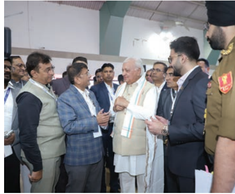
Hon'ble Governor of Bihar Shri Arif Mohammad Khan during a discussion with the Chamber President