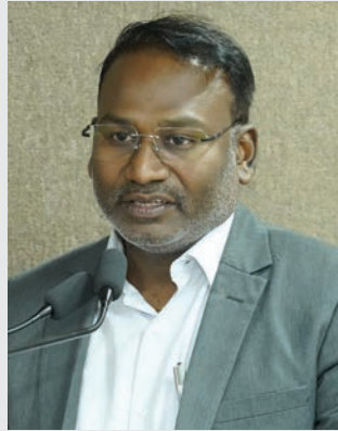
Shri M. Nagarajan (IAS) Municipal Commissioner of Surat

Regarding cleanliness, Shri Nagarajan stated that a special month-long cleanliness drive will be launched, and both short-term and long-term