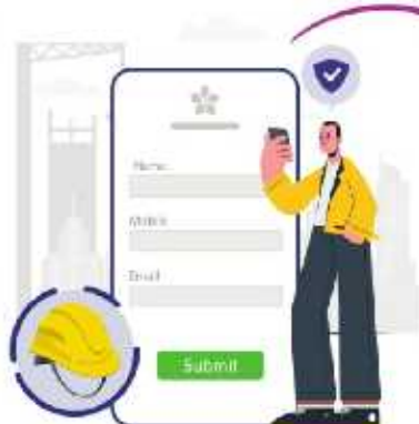
2. Capture visitor details digitally