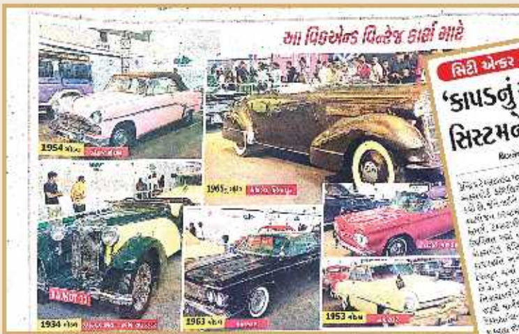
Gujarat Mitra 14 MAR.