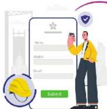
2. Capture visitor details digitally