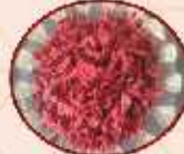
Amla Beet Ginger