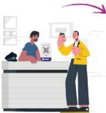
1. Simplify check-ins with a quick QR code scan

Smart Visitor Management for your Business