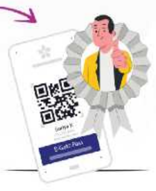
4. Issue secure digital passes for authorized access