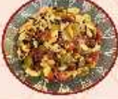
Seeds & Berries