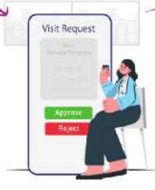
3. Hosts can approve or reject visitor requests in real time