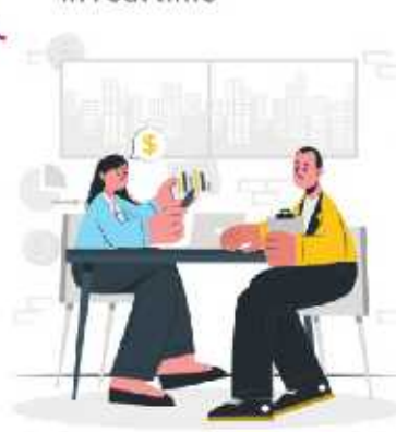
5. Facilitate meetings with scheduled check-ins