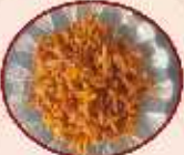
Amla, Amba Ginger, Haldar