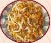
Gujarati Flax Seeds